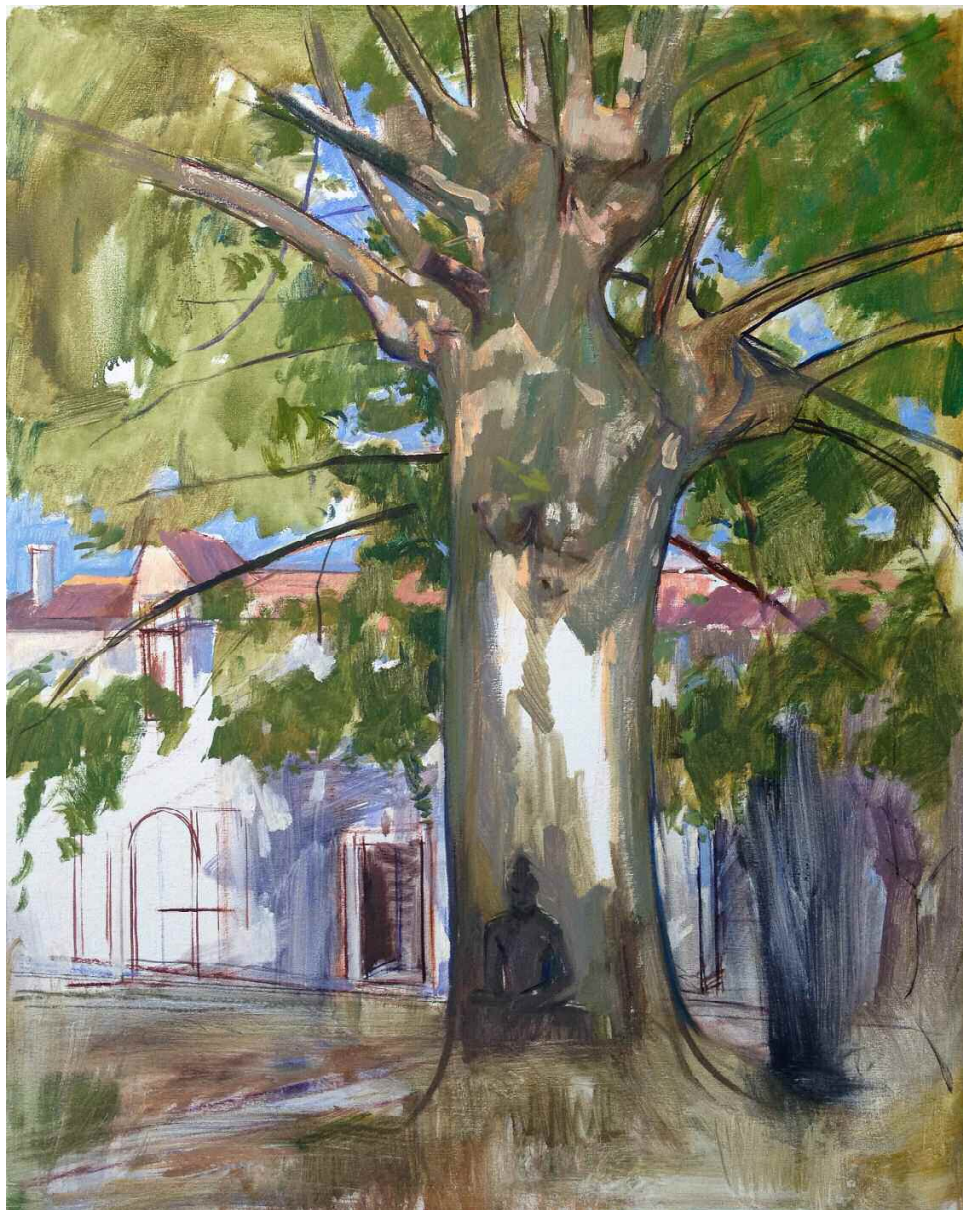
Light, Religion and Nature, Samuel Adoquei. Oil on canvas 30 x 24

Govindu asked Tarao, can't you tell how all in life falls within Nature's perfect structure and order? Every-