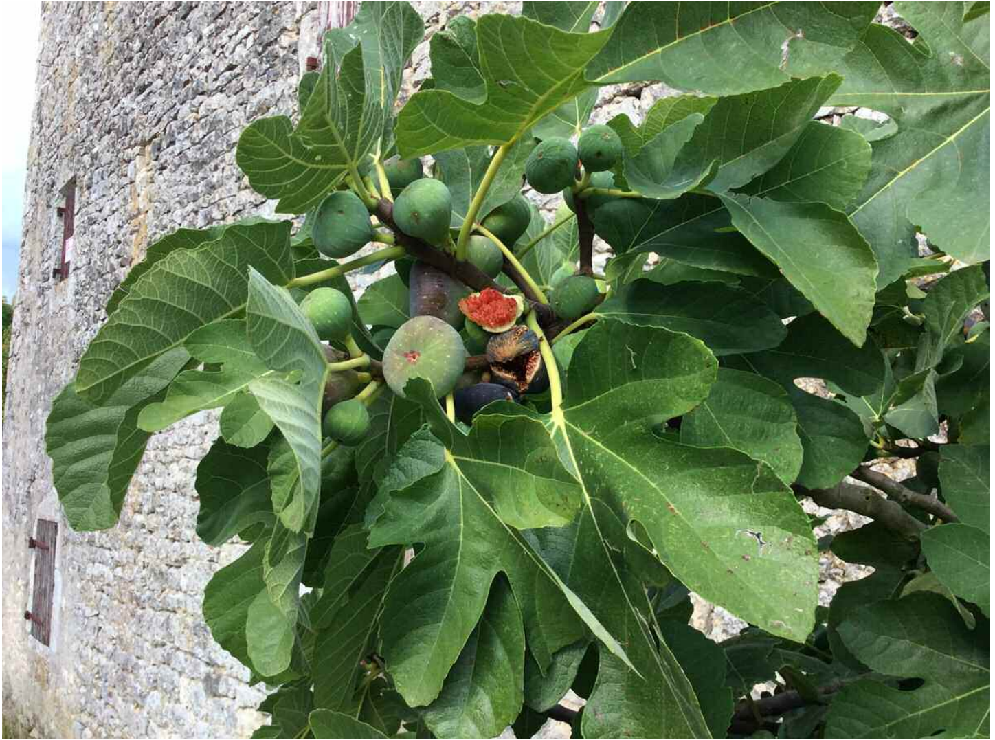
A Fig Tree: Samuel Adoquei

what do you think will happen if the trunk decides to keep and abuse his power? Who do you think will shelter the trunk when the wild wind arrives? What do you think will happen if the trunk tries to control life around him?