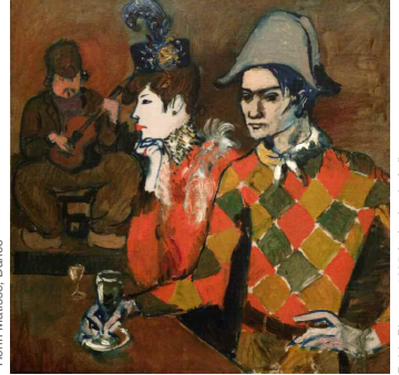
Pablo Picasso 1905 At the Lapin Agile