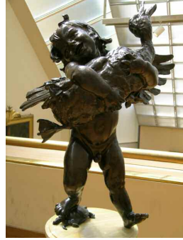
MacLormie. Boy and Duck. Metropolitan museum