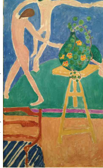
Henri Matisse. Dance