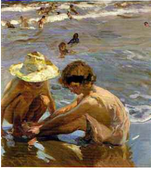
Joaquín Sorolla y Bastida