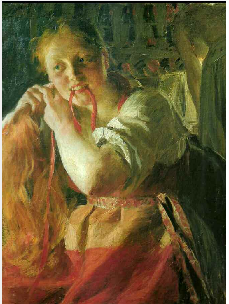
Painted by Anders Zorn